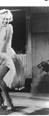
"I'm not interested in money, I just want to be wonderful."