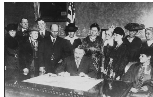
Ratification of the 19th Amendment