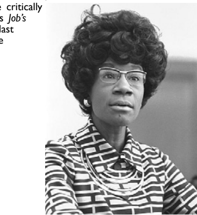
"Tremendous amounts of talent are being lost to our society just because that talent wears a skirt." - Shirley Chisholm, politician, educator & author; the first black woman to serve in the United States Congress. (1924 - 2005)