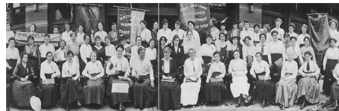
National Women's Trade Union 1917