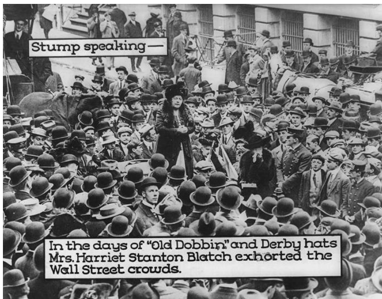
In the days of "Old Dobbin" and Derby hats Mrs. Harriet Stanton Blatch exhorted the Wall Street crowds.